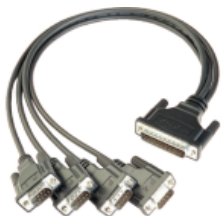
DB44M to DB9Mx4